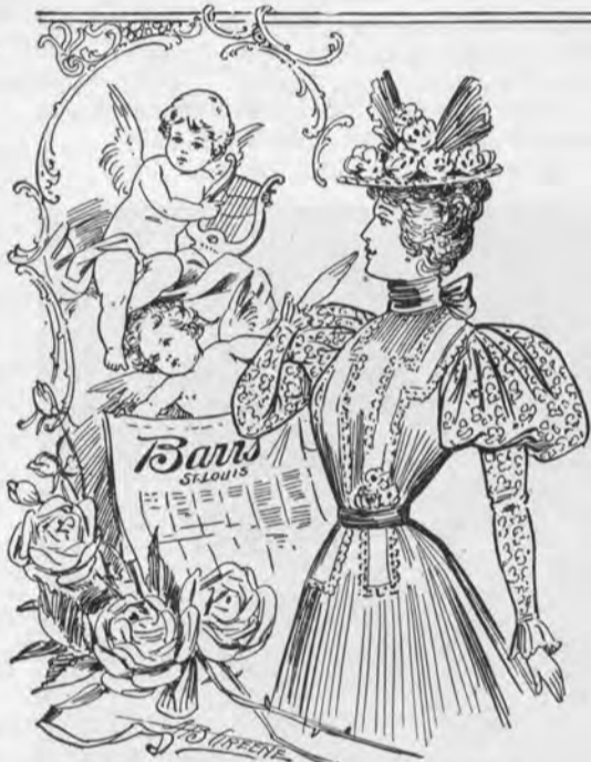
SIXTH, OLIVE AND LOCUST.

P. S.—Mail Orders are answered the same day as received, and special attention is given to accurately filling them.